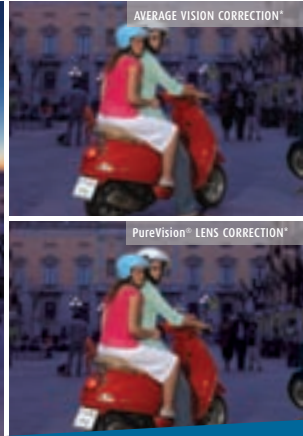
*Simulated retinal images